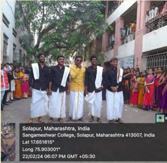
Solapur, Maharashtra, India Sangameshwar College, Solapur, Maharashtra 413007, India Lat 17.651815° Long 75.903001° 22/02/24 06:07 PM GMT +05:30