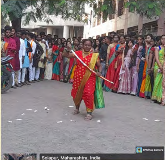
Solapur, Maharashtra, India