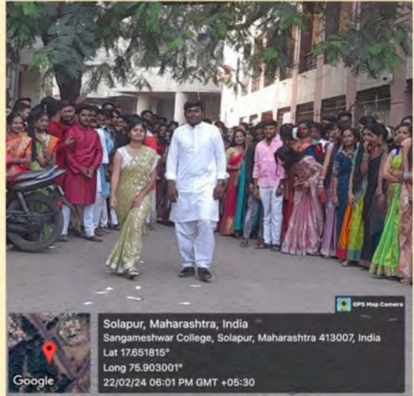
Solapur, Maharashtra, India Sangameshwar College, Solapur, Maharashtra 413007, India Lat 17.651815° Long 75.903001° 22/02/24 06:01 PM GMT +05:30