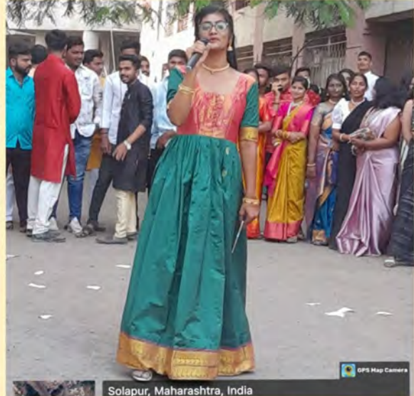
Solapur, Maharashtra, India