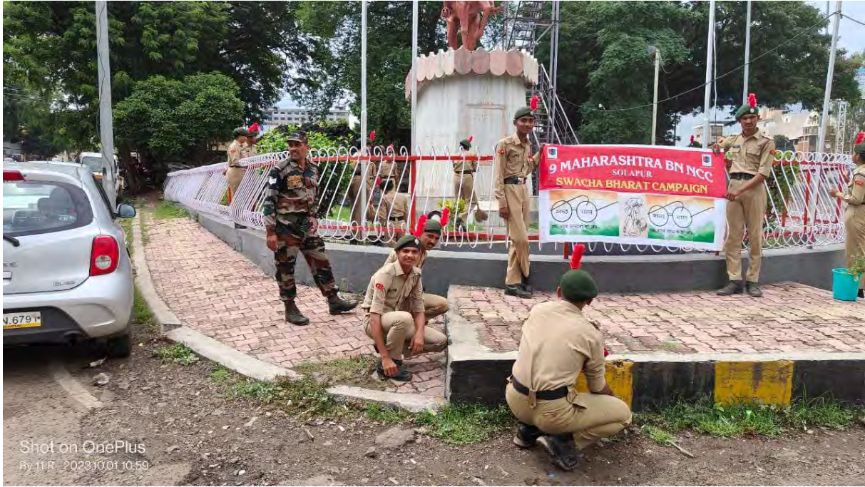
Shot on OnePlus By 11R 2023/10/01 10:50