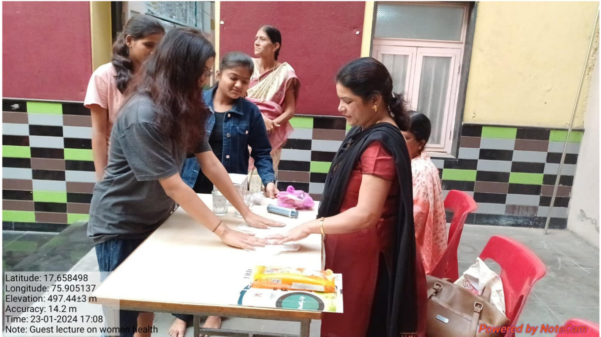
Latitude: 17.658498 Longitude: 75.905137 Elevation: 497.44±3 m Accuracy: 14.2 m Time: 23-01-2024 17:08 Note: Guest lecture on women health