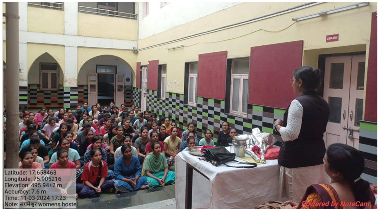
Latitude: 17.658463 Longitude: 75.905216 Elevation: 495.94±2 m Accuracy: 7.6 m Time: 11-03-2024 17:23 Note: संगमेश्वर womens hostel