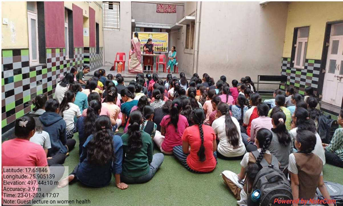
Latitude: 17.65846 Longitude: 75.905139 Elevation: 497.44±10 m Accuracy: 3.9 m Time: 23-01-2024 17:07 Note: Guest lecture on women health