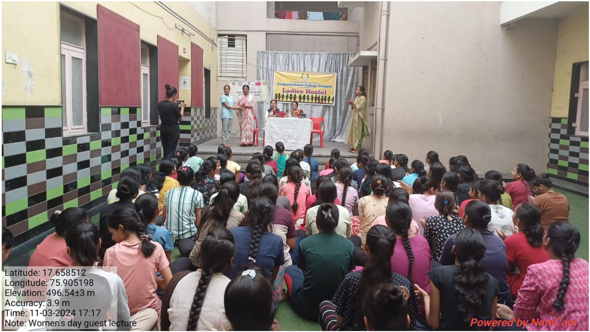
Latitude: 17.658512 Longitude: 75.905198 Elevation: 496.54±3 m Accuracy: 3.9 m Time: 11-03-2024 17:17 Note: Women's day guest lecture