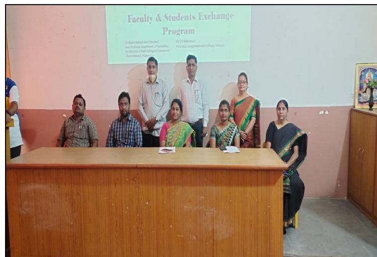
Inaugural Session of Faculty – Student Exchange Programme 2021 – Faculty from A S Patil College of Commerce, Bijapur – 22/11/21