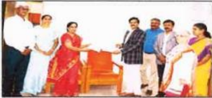
MOU between Sangameshwar College, Solapur (Autonomous) and A S Patil College of Commerce Bijapur – by a MOU Deed